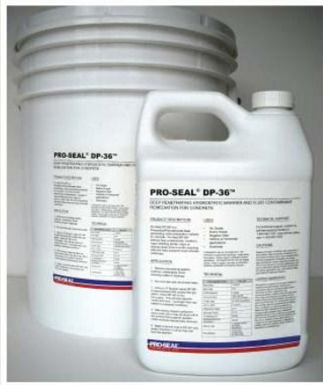
Available in 1 gallon, 5 gallons & 55 gallons

Pro-Seal DP-36® is a single component polycarbon/polycarbonate reactive, osmotic, liquid that seals, densifies, hardens, reduces vapor drive and preserves most concrete substrates when used as part of a Pro-Seal® system.